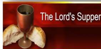
The Lord's Supper

YOUR WEEKLY OFFERING can be dropped in the plate at the auditor- ium entrance or mailed to the Church address